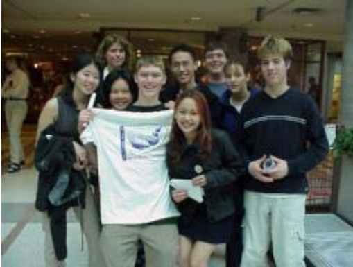
High School Tour (George Waters Middle School)