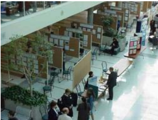
(Aerial view of Brodie Centre)